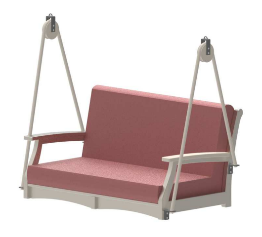
Love Seat Swing