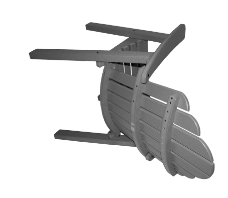
STEP #3 -Your Chair is complete!