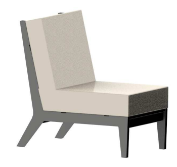
Center Armless Section